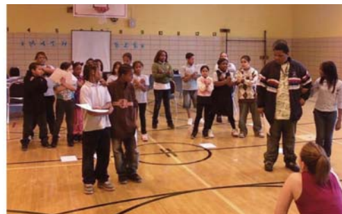
Students at PS 257 rehearse a scene from Romeo and Juliet .