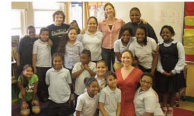
Acting Company Teaching Artists with students of PS 257 in Brooklyn

"My students have been exposed to a whole new world by experiencing Shakespeare for the first time. It was amazing to see how they readily grasped the techniques and information taught by the teaching artists."