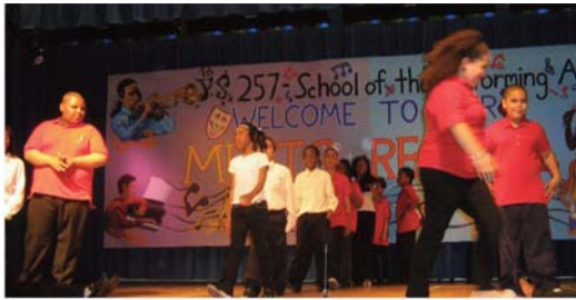
Students performing a selection from Romeo and Juliet .

Primary Shakespeare engages young students in the the works of the Bard by putting them at ease with his language before they decide it is “too hard to understand.” It presents the works of Shakespeare in an accessible manner. Students read, listen to and speak the words themselves and discover it’s really not that difficult— it can actually be fun and interesting.