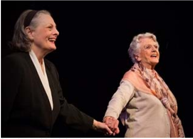
Dana Ivey and Angela Lansbury